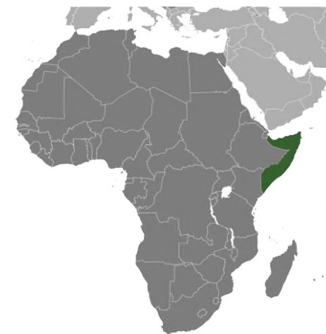
Somalia is located east of Ethiopia in Eastern Africa. It borders the Gulf of Aden and the Indian Ocean. Somalia's entire experience with formal government has been one of plunder and resource extraction by the ruling elite.

After a verdict is reached the criminal must compensate his victim the appropriate amount. If he is unable or unwilling, his extended family must pay the compensation. Every Somali is born into an insurance group based on his lineage to a common great-grandfather. Out of their own self-interest these insurance groups help enforce the judgment on wrongdoers. When an individual becomes particularly troublesome a family can publicly declare that he is no longer a member, effectively making the person an outlaw. Outlaws must find another insurance group willing to sponsor them, or they are expelled from the larger clan. In cases in which more formal enforcement of the law is necessary, clan elders can call for all clansmen to form a posse to enforce the verdict; clansmen are obligated to answer the call.